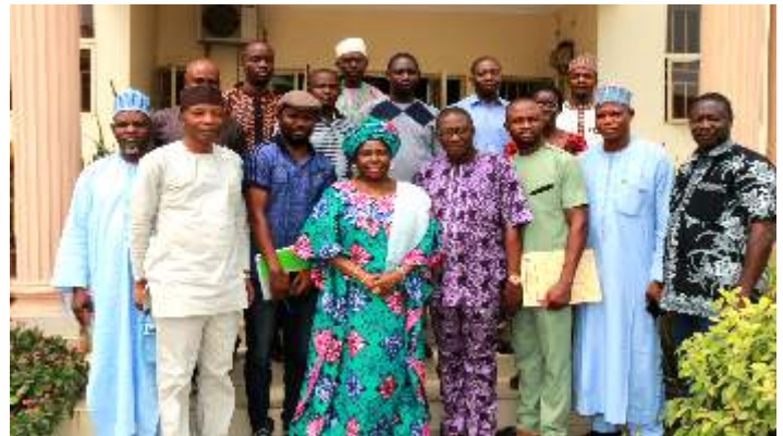
The Vice-Chancellor in a group photograph with the new ASUU Executive

In her response, the Vice-Chancellor said she lifted the ban on union activities immediately she assumed office because of the value she place on staff welfare, hence acknowledge and appreciate the role of ASUU in the welfare of its members. Also, she promised to continue to support ASUU and enjoined them to interact more with Management to ensure free flow of accurate information between Management and ASUU to forestall industrial disharmony.